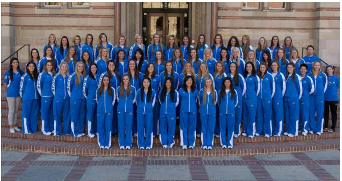
2013 UCLA WOMEN'S ROWING TEAM